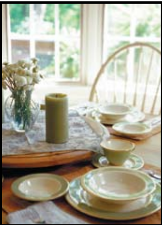
In the kitchen . . .