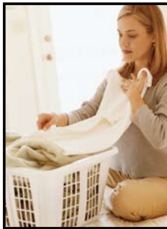
In the laundry . . .

Economical Water Conditioning System SAVES You Money!