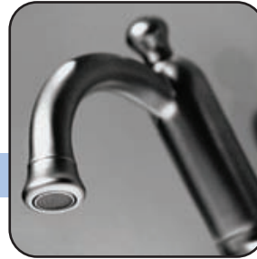
Better from the faucet.