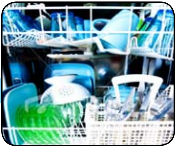
Better in the kitchen.